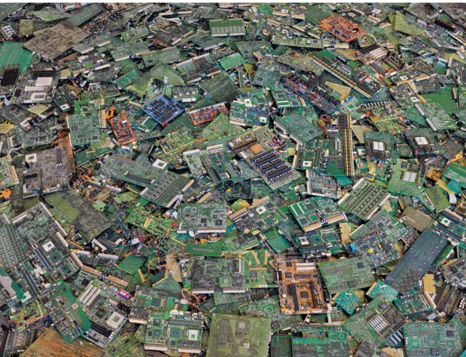
A pile of old circuit boards

food, for every kilo we eat, ten kilos of waste is generated along the food chain. For consumer goods the trail of waste can be much greater. A car that weighs a tonne takes seventy tonnes of material to produce. Waste is the leviathan of the modern industrial system.