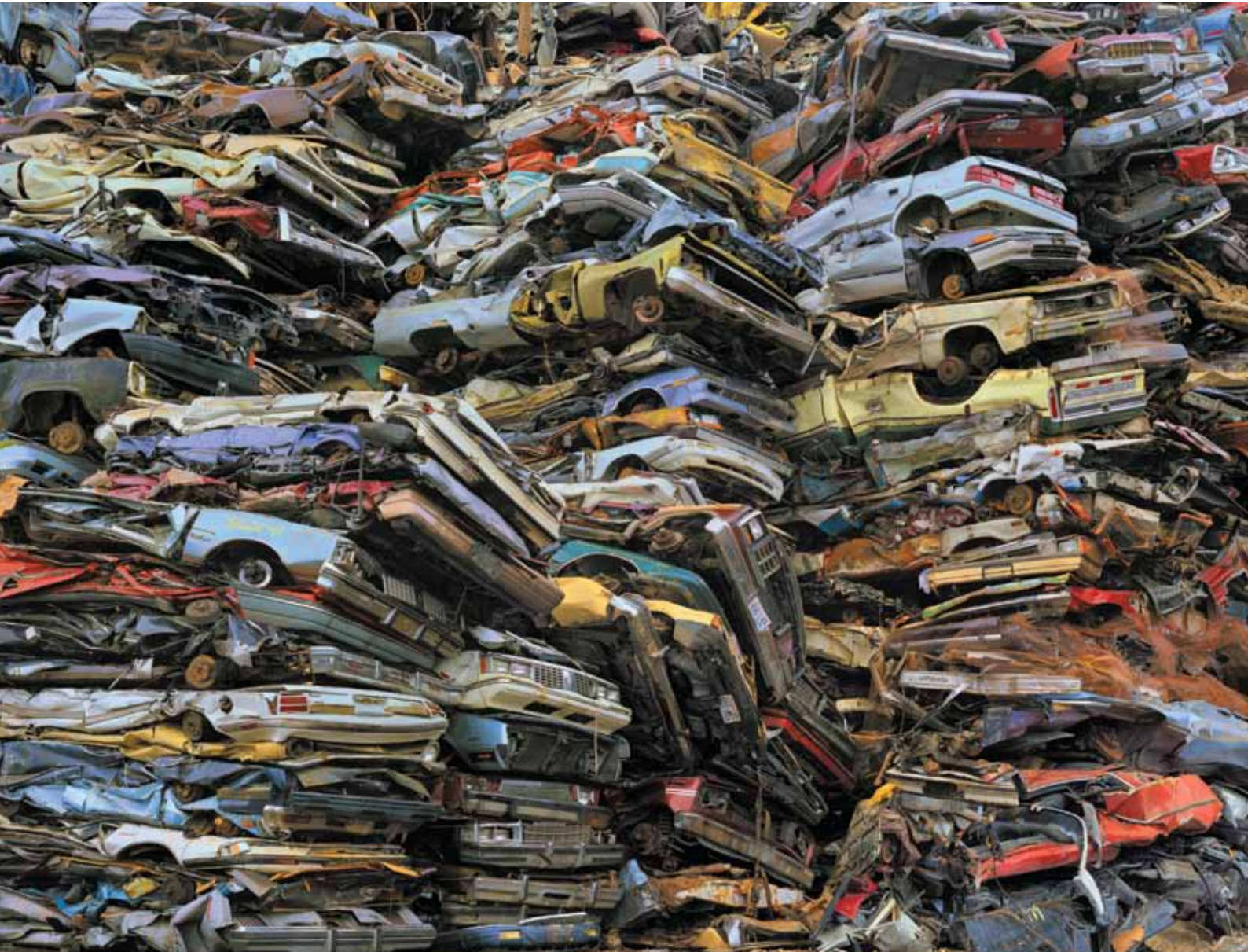
A wasted heap of scrapped cars